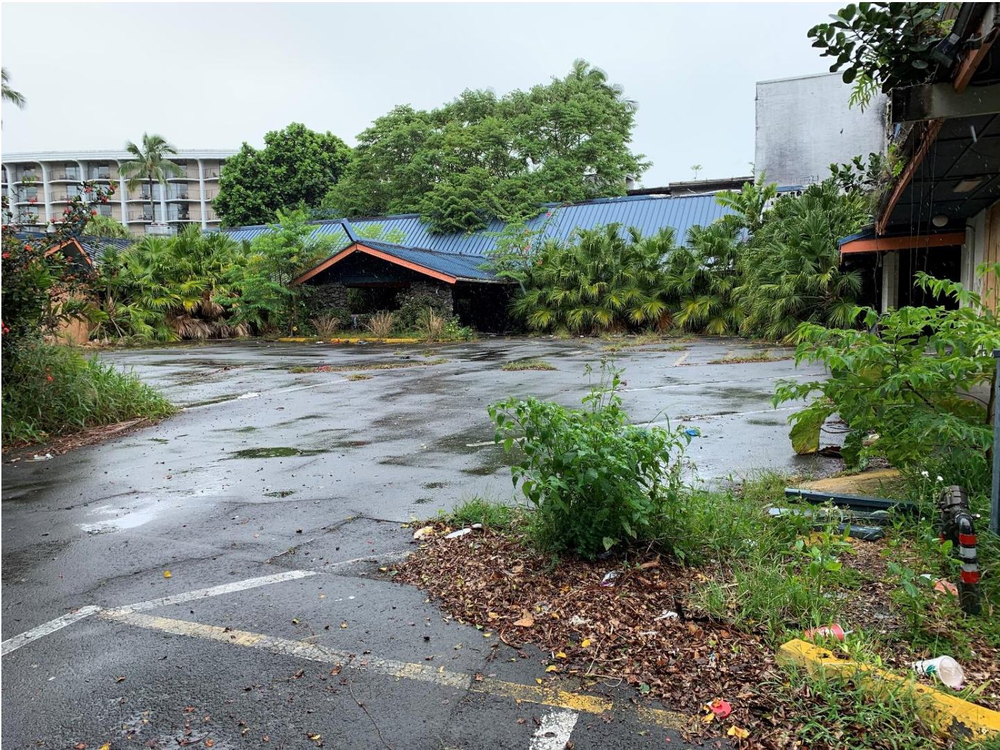
All vegetation (including roots) to be removed except behind and on buildings.