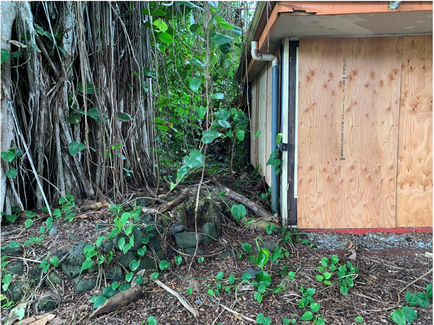
Front left-side boarder of property, all ground vegetation (including roots) to be removed, up to area parallel with building.