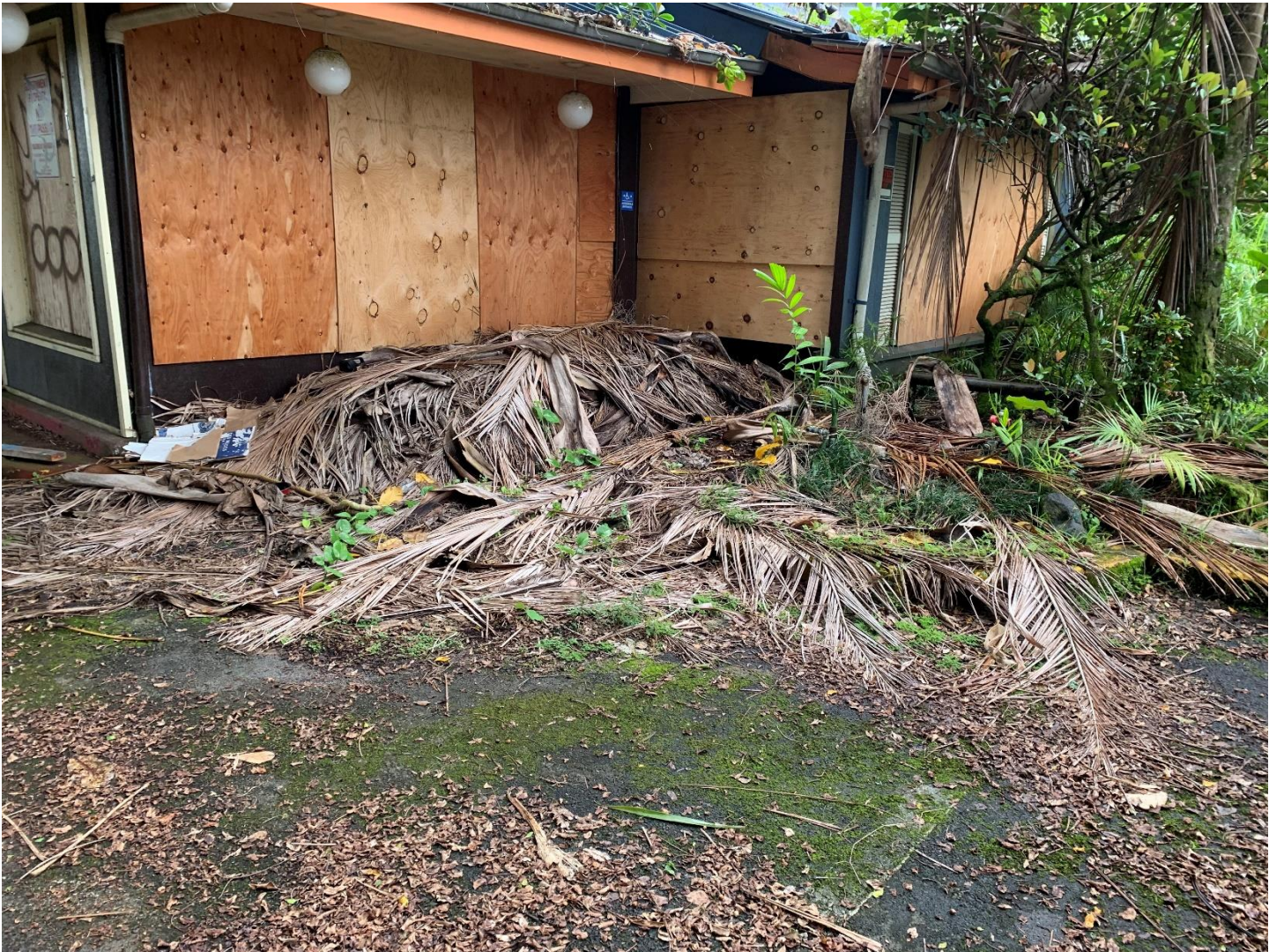
Front left-side of property, this area to be cleaned up as part of parking area.