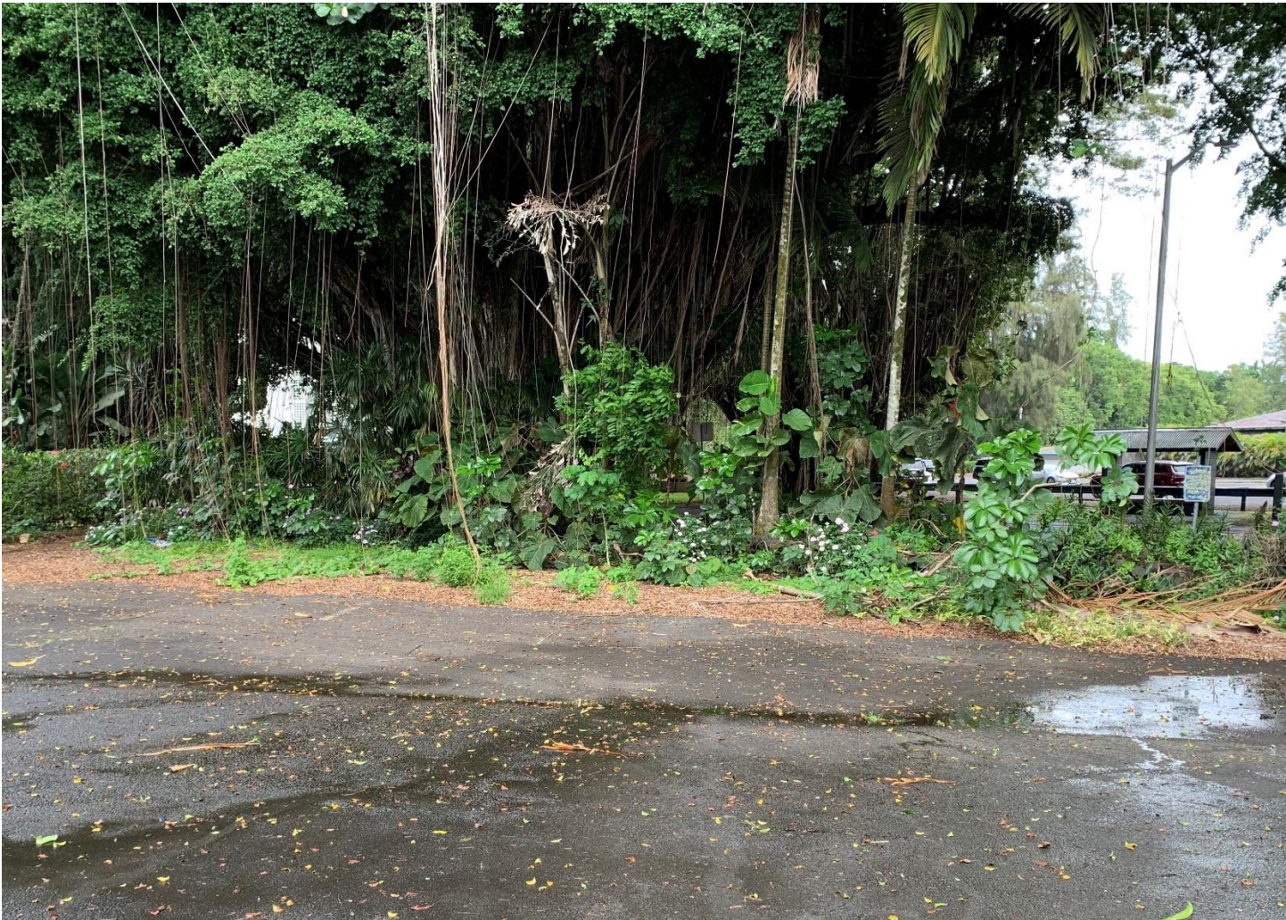
Back-side of property facing Banyan Drive, all vegetation (including roots) to be removed except banyan tree and tall palm trees.