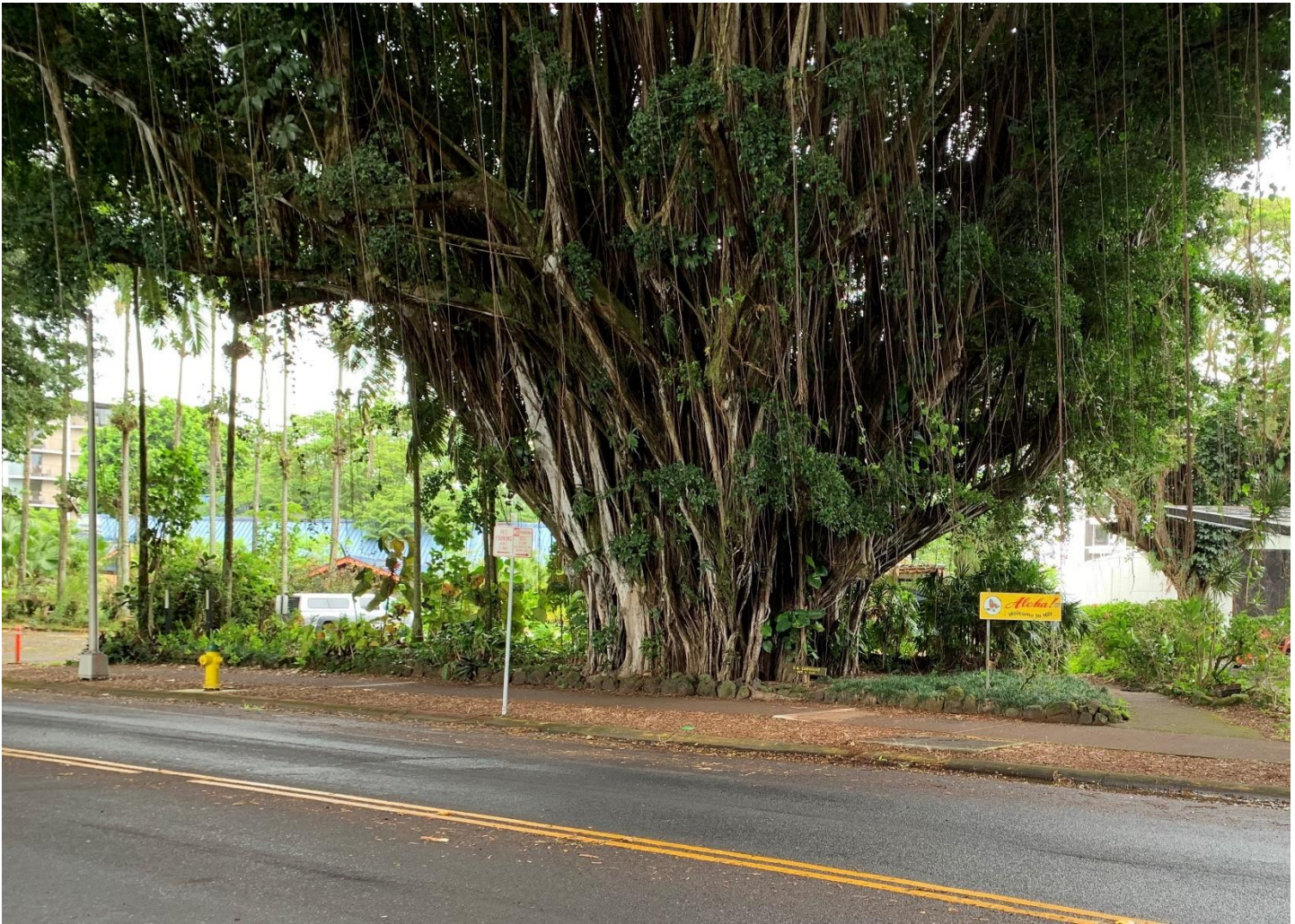
Front right-side of property, all vegetation (including roots) to be removed except banyan tree, tall palm trees, and mondo grass in right corner.