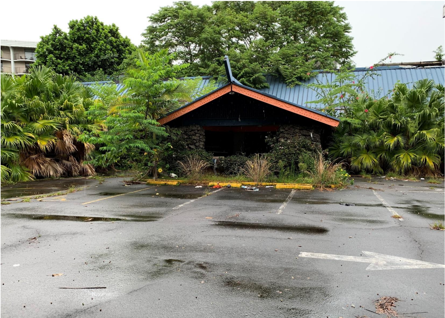
Front entrance to hotel, all vegetation (including roots) to be removed, except behind building.