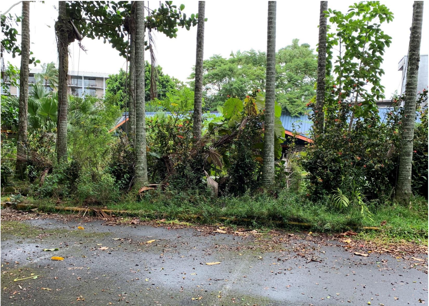
Vegetation island in parking area, all vegetation (including roots) to be removed except tall palm trees.